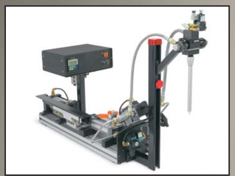
Model 860 Single Acting MMD