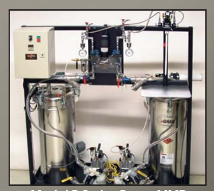
Model B Series Pump MMD