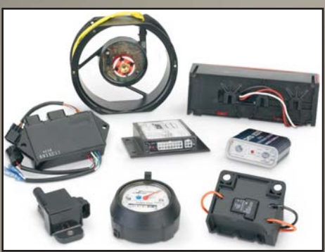
Typical Customer Parts

VACUUM ENCAPSULATION FILLING SEALING XYZ DISPENSING