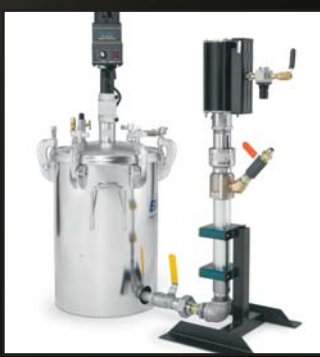
Feed Tank & Pump

1130 Rt 1, Newcastle, Maine 04553 USA Tel: 207-563-2299 FAX: 207-563-2619 www.exactdispensingsystems.com