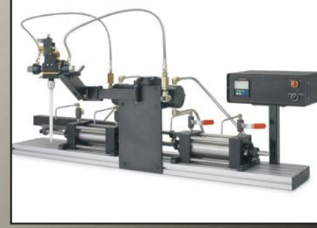
Model 9450 Double Acting MMD