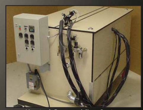
Heated Overmolding System

VACUUM ENCAPSULATION FILLING SEALING XYZ DISPENSING