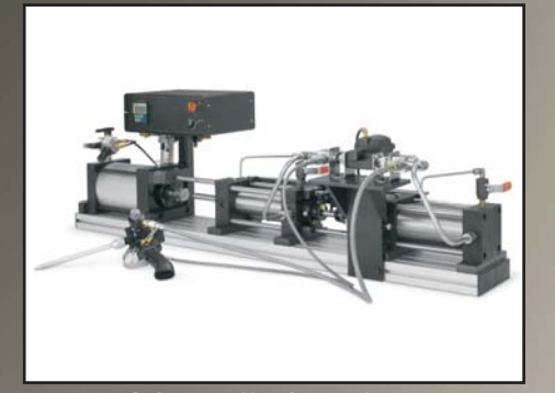
Model 9450 Single Acting MMD

Since 1978, EXACT Dispensing Systems has been designing and building standard and custom dispensing systems for use in a variety of industrial applications, including: