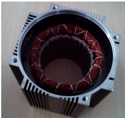
Before Sealant Filling