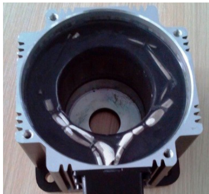
After Sealant Filling