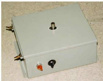
Basic Unfixtured Drive Unit