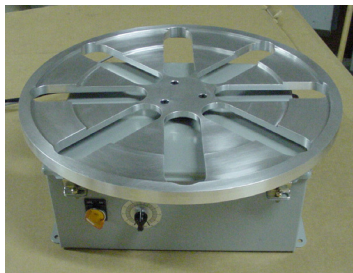
Stepped 18" nest on console