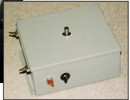
Basic Unfixtured Drive Unit