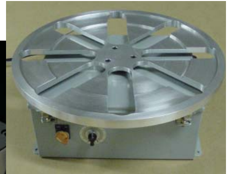
Stepped 18" nest on console