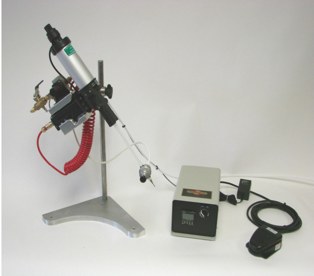
50 cc capacity with Digital Timer and Pinch Valve