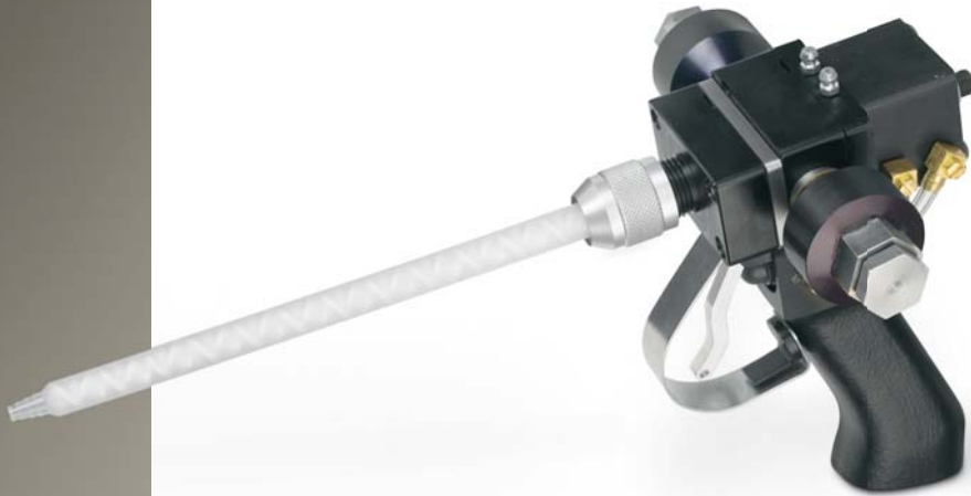
Autovalve shown with optional Triggerhandle